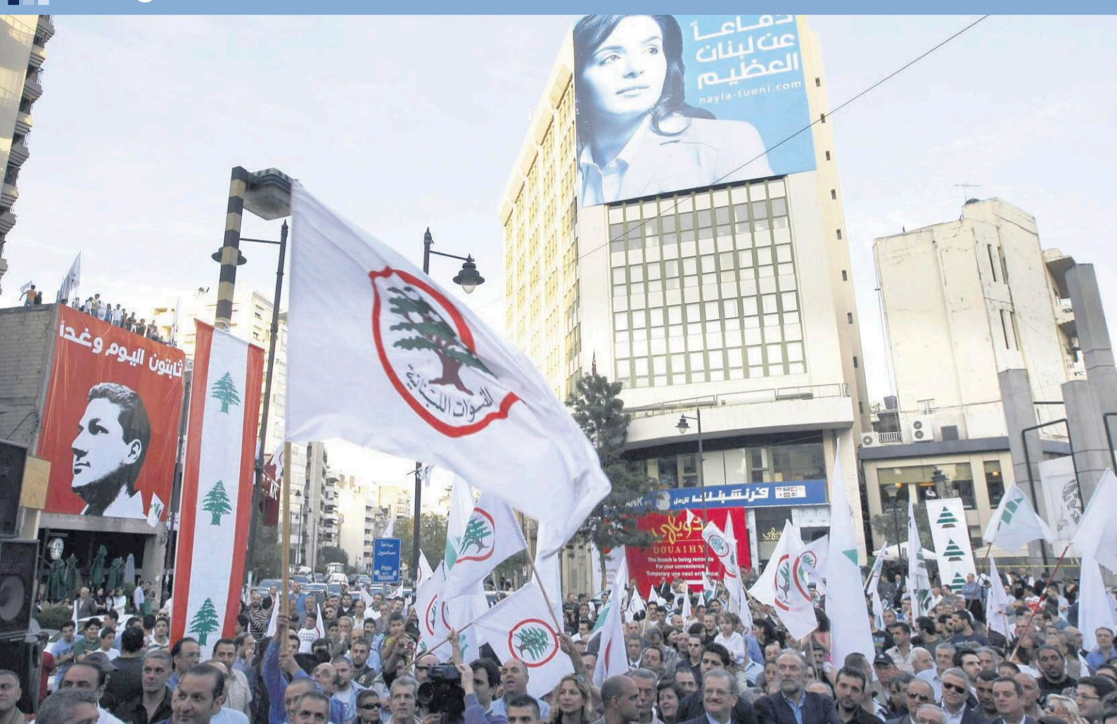
Supporters of the Lebanese Forces and the Kataeb Party, members of the March 14 coalition, at a rally in the Beirut suburb of Ashrafieh.